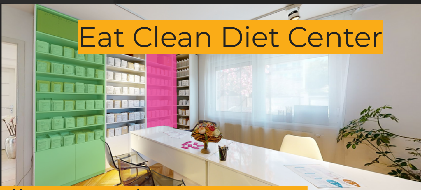
Eat Clean Diet Center